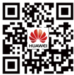
Huawei Enterprise APP

To learn more about Huawei storage, please contact the local office or visit Huawei Enterprise website http://e.huawei.com .